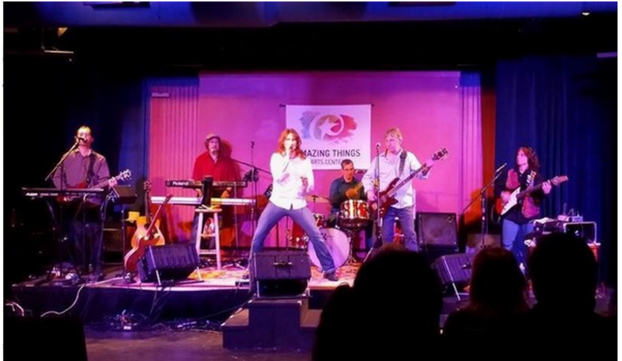
The members of AfterFab.