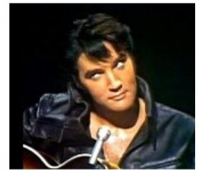
Happy birthday to the King: 5 ways to celebrate Elvis Presley's 80th