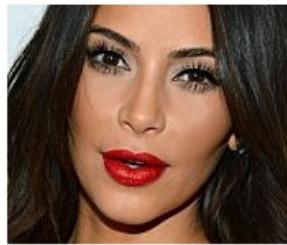
20 Extremely Dumb Celebrities Rant Lifestyle