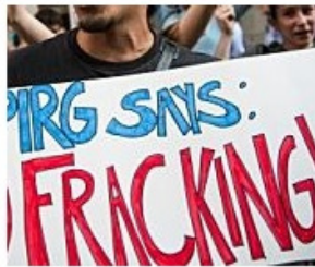
Study proves fracking caused Ohio earthquakes